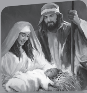
THE FIRST COMING OF JESUS