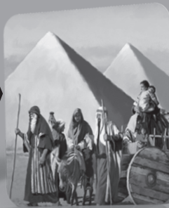
THE EXODUS FROM EGYPT