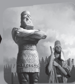
THE CAPTIVITY IN BABYLON

The Bible is one continued story of the history of God's love for humankind. The various names we give it are an indication of that fact: The Plan of Salvation , The Great Controversy Between Christ and Satan , Eden Lost to Eden Regained , to name a few. Like any well-written story, the Bible contains both major and minor events. Certain Bible stories tell of major turning points in human history. These are events that change life forever. Six of these stories have been pictured for you as pillars to make a framework on which to hang all the events of the Bible: Creation, the Flood, the Exodus (from Egypt), the Captivity (in Babylon), Jesus' first coming, and Jesus' second coming.